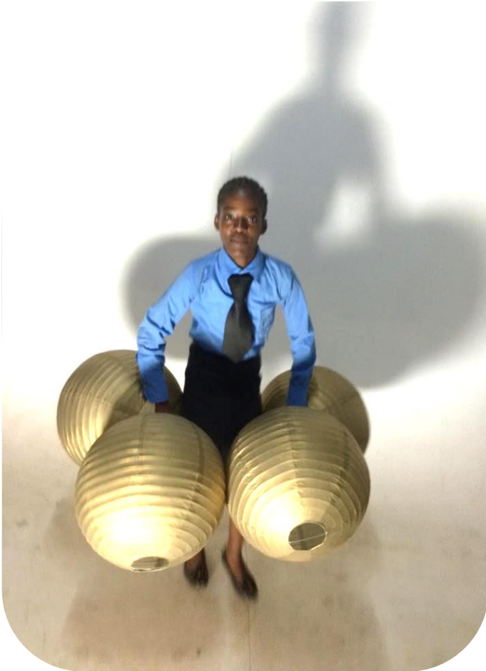
AAA girl creating a new image!

African Action on AIDS appreciates being chosen to be part of the “Looking at History Through the Eyes of a Child” Project, which validates the visual heritage of Cameroon and contributes in building self-confidence, critical thinking and solid/positive partnerships among nations!