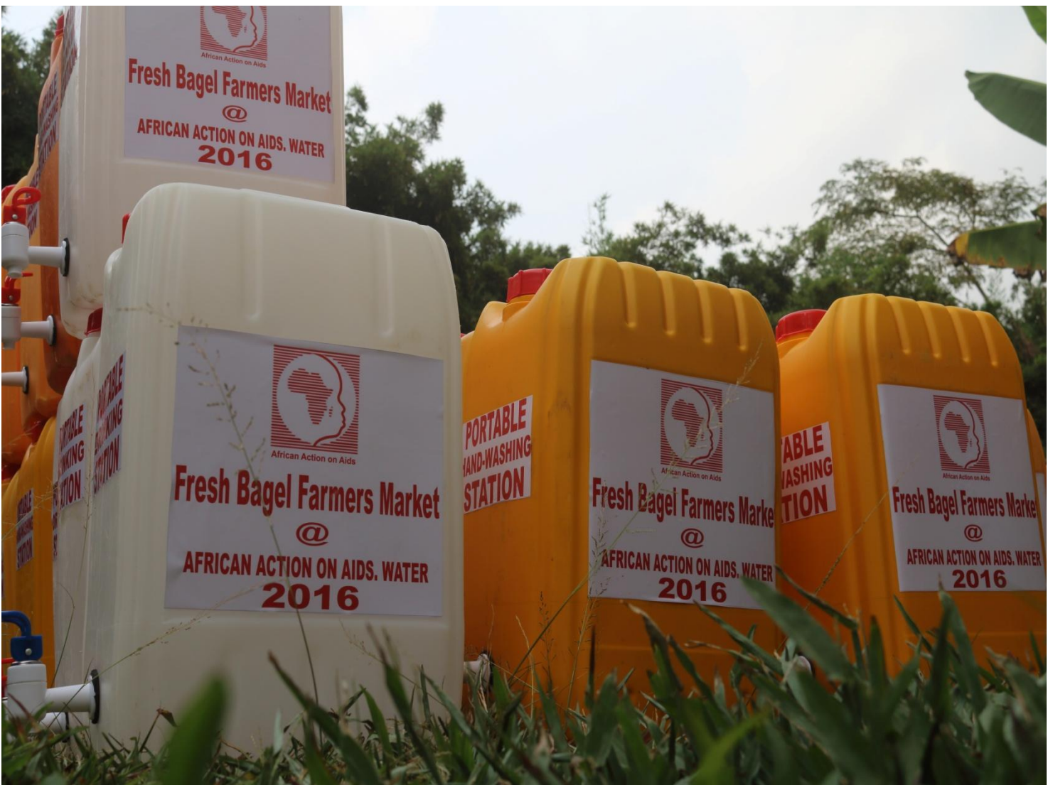
16 water stations were sponsored by Fresh Bagel Farmers Market

It was decided that one of the YOUTH WEEK 2017 activities will be organized in a private home that hosts one of our scholars. The said activity will focus on practical organization of a safe water and sanitation system that allow a low income household to prevent diseases. Through that action, we would like to strengthen health in homes that receive our scholars.