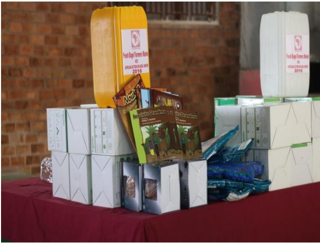
View of some christmas gifts