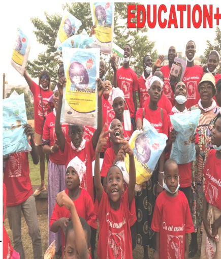
AAA girls sponsored by Batonga give Scholarships to others.