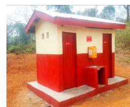
This is what an AAA block of 4 toilets looks like !