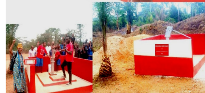
This is what an AAA water well looks like!