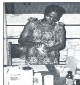
The Pharmacist of Bogso